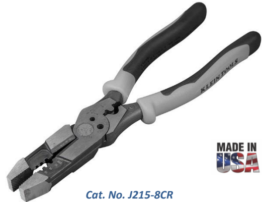
Cat. No. J215-8CR

With full length, induction hardened knives and a high-leverage design, these hybrid pliers provide more cutting power. It cleanly strips 10-14 AWG solid and 12-16 stranded wire. Convenient holes for bolt shearing plus a crimper for non-insulated connectors, lugs and terminals make this a must-have tool for any bag.