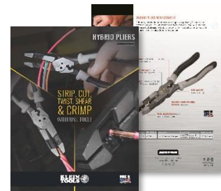
Cat. No. 96495

For further information regarding this product, contact your local sales representative.